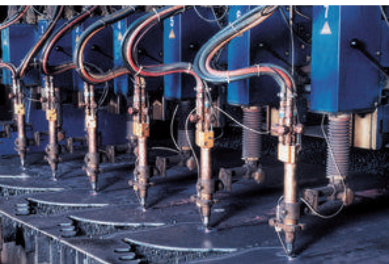
Mechanical flame cutting with multitouch operation